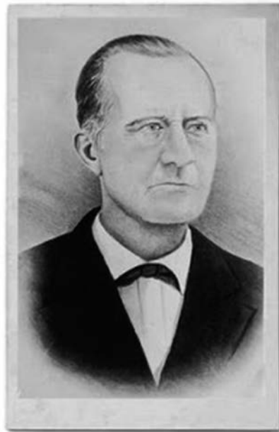
Facundo Bacardí Massó

In that respect, the Bacardi Company was no different than any other trademark owner. It owned a valuable brand and wanted to extract as much value as it could out of that brand. It saw the Bacardi cocktail as a way to leverage a cultural phenomenon into additional sales. And it worked like gangbusters.